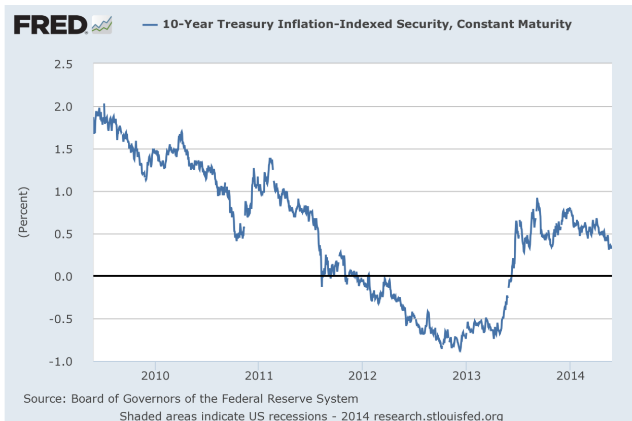
Chart 4 33

netting the rates in Chart 4 (10-year TIPS) and Chart 1 (10-year Treasury), an estimate for inflation expectations can be calculated. For example, at the end of April 2014 the 10-year CMT was 2.67 percent and the 10-year TIPS 0.49 percent, so expectations were for inflation of 2.18 percent.