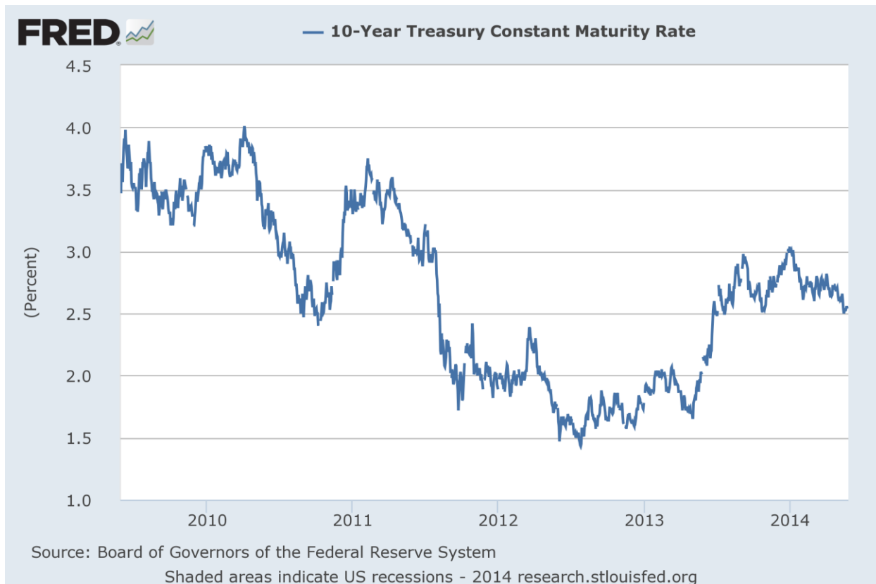
Chart 1 6

Interest rates can stay low for a long time, as we have seen in Japan, where they have been below 1 percent for over 20 years. Many now refer to a long-term low interest rate scenario as a “Japan” scenario.